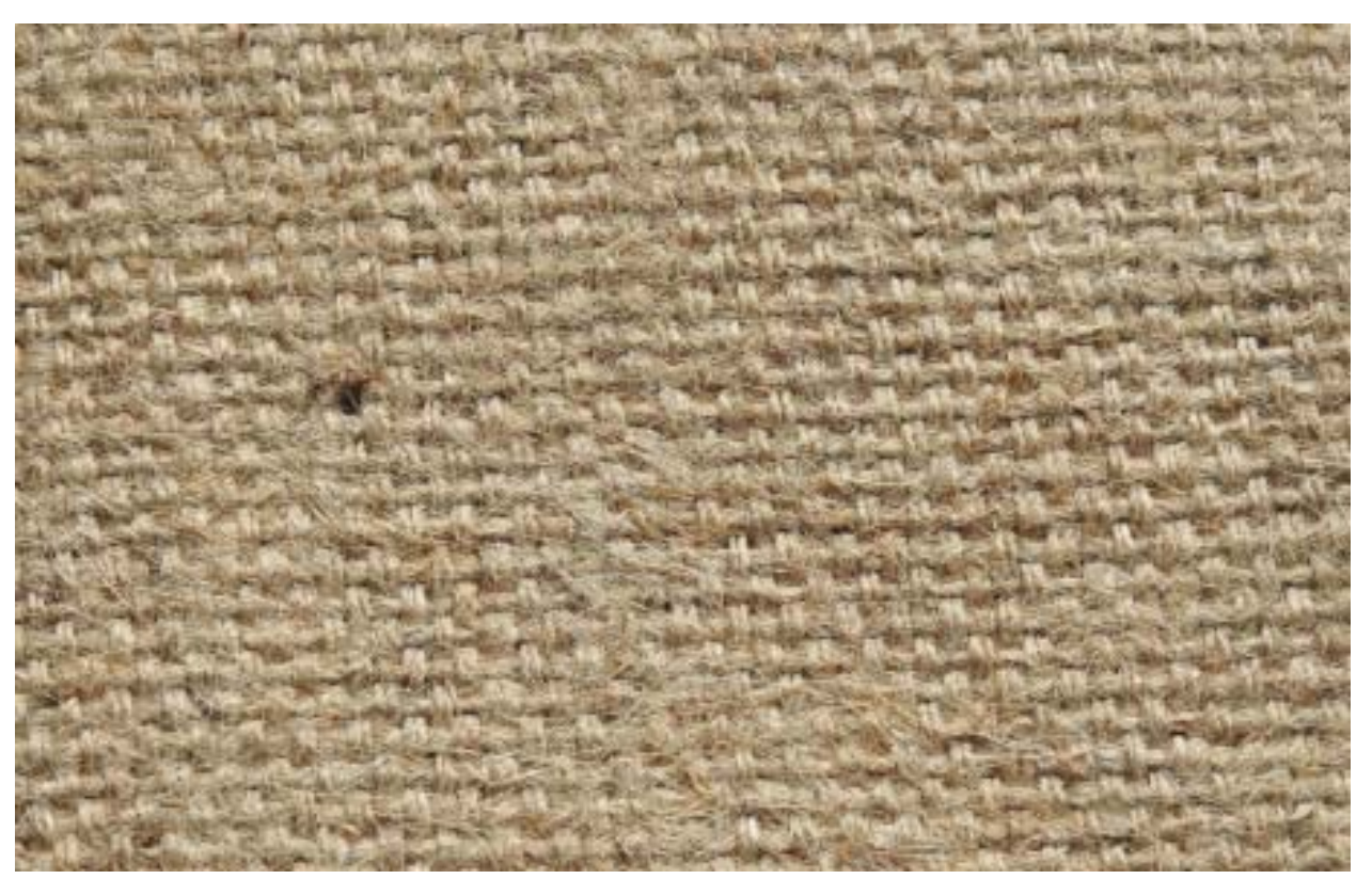
25 kn/m, 724 gsm