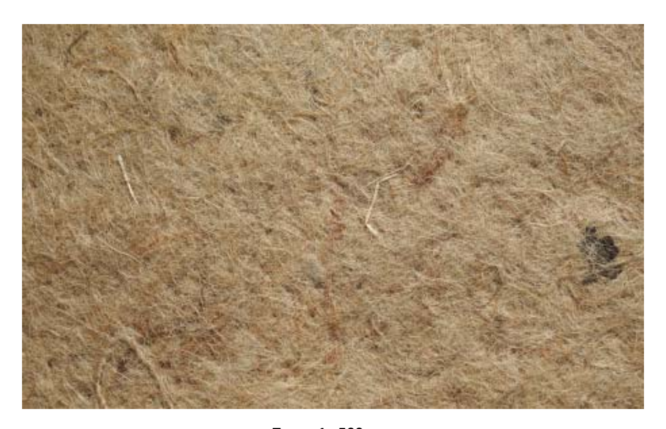
Type - 1 : 500 gsm