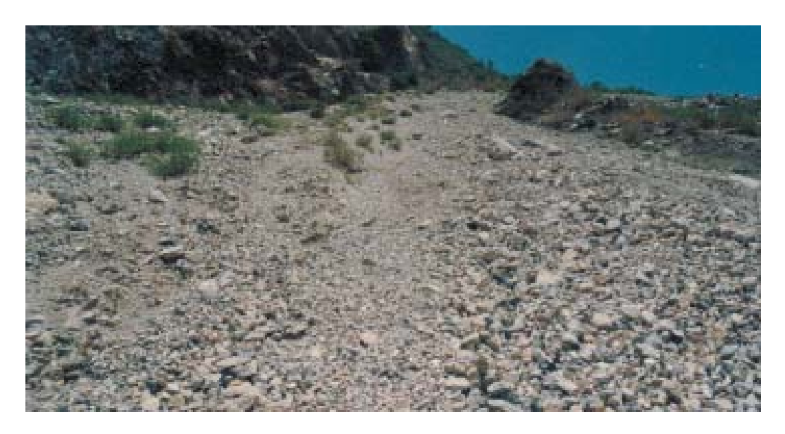
Destabilised hill slope, Sahashradhara