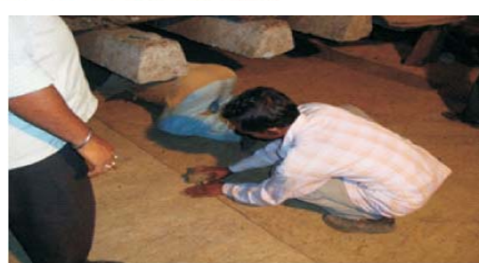
NONWOVEN JUTE GEOTEXTILE LAID ON THE FORMATION OF RAILWAY TRACK

NON WOVEN JUTE GEOTEXTILE AS TRENCH DRAIN