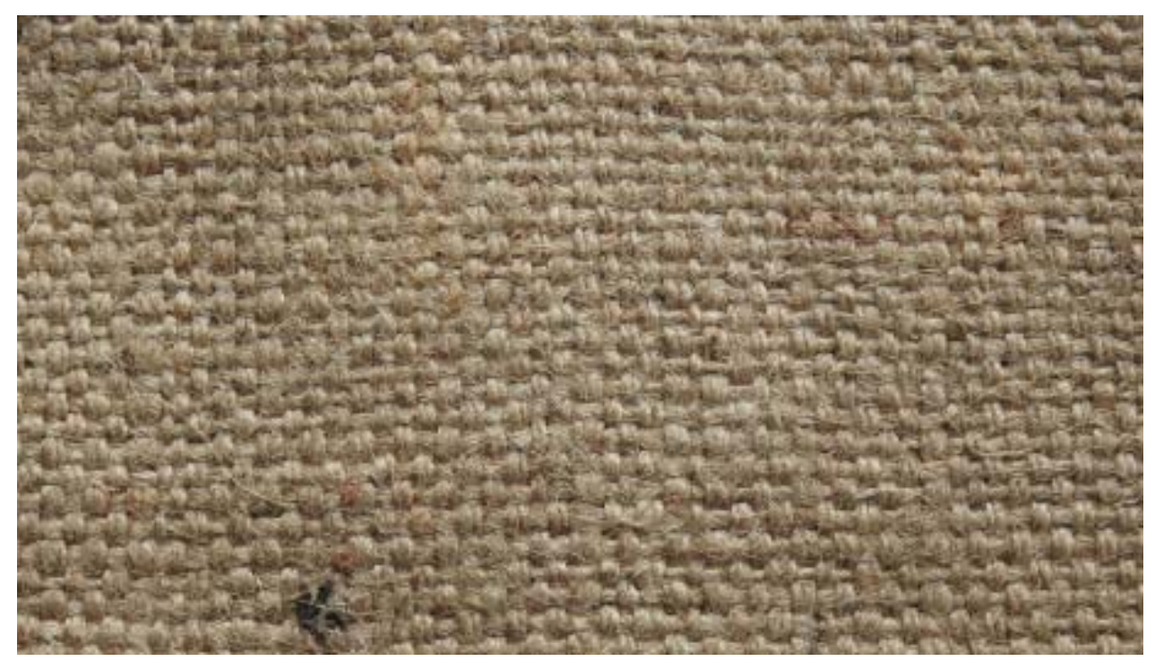
20~kN/m, 627~gsm (Water repellant & durable)