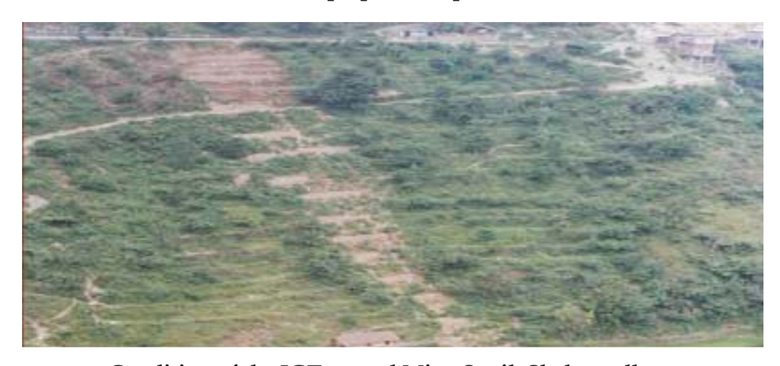
Condition of the JGT treated Mine Spoil, Shahasradhara