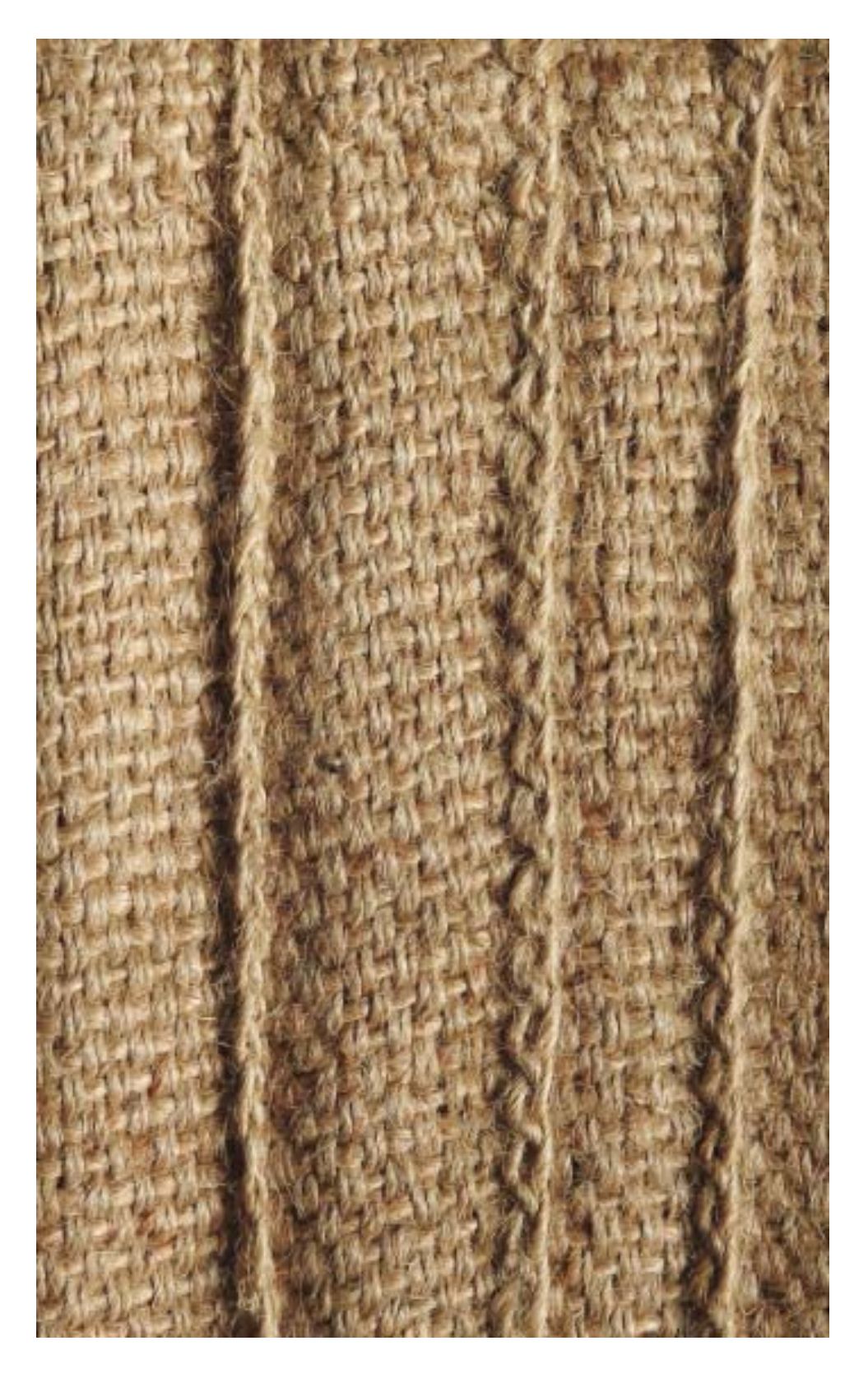
Pre- Fabricated Vertical Jute Drain