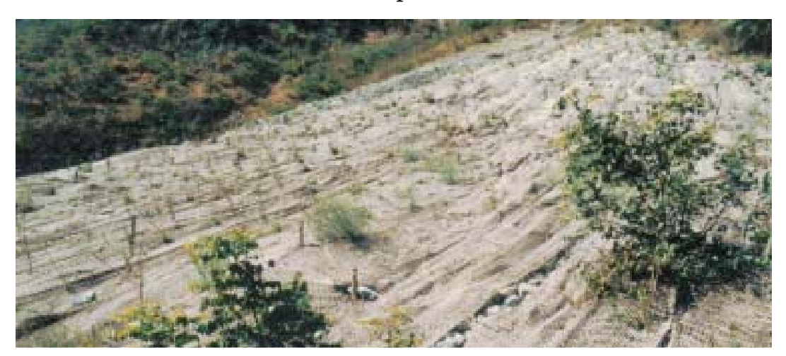
JGT laid over the prepared slope, Shahasradhara