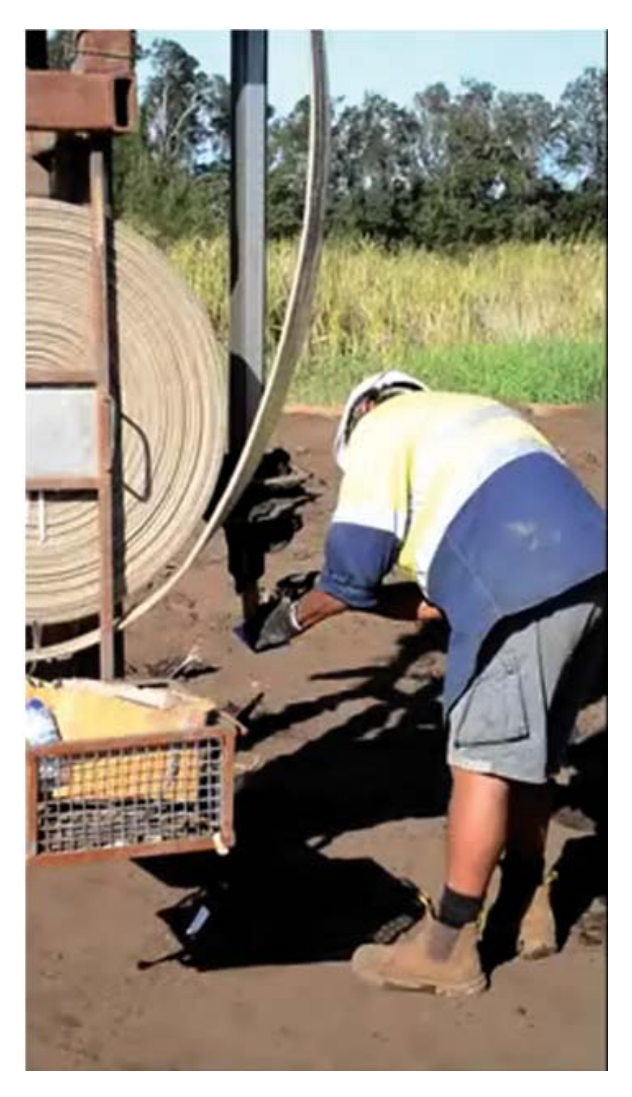
PRE- FABRICATED VERTICAL JUTE DRAIN FOR ACCELERATED CONSOLIDATION OF SOFT SOIL