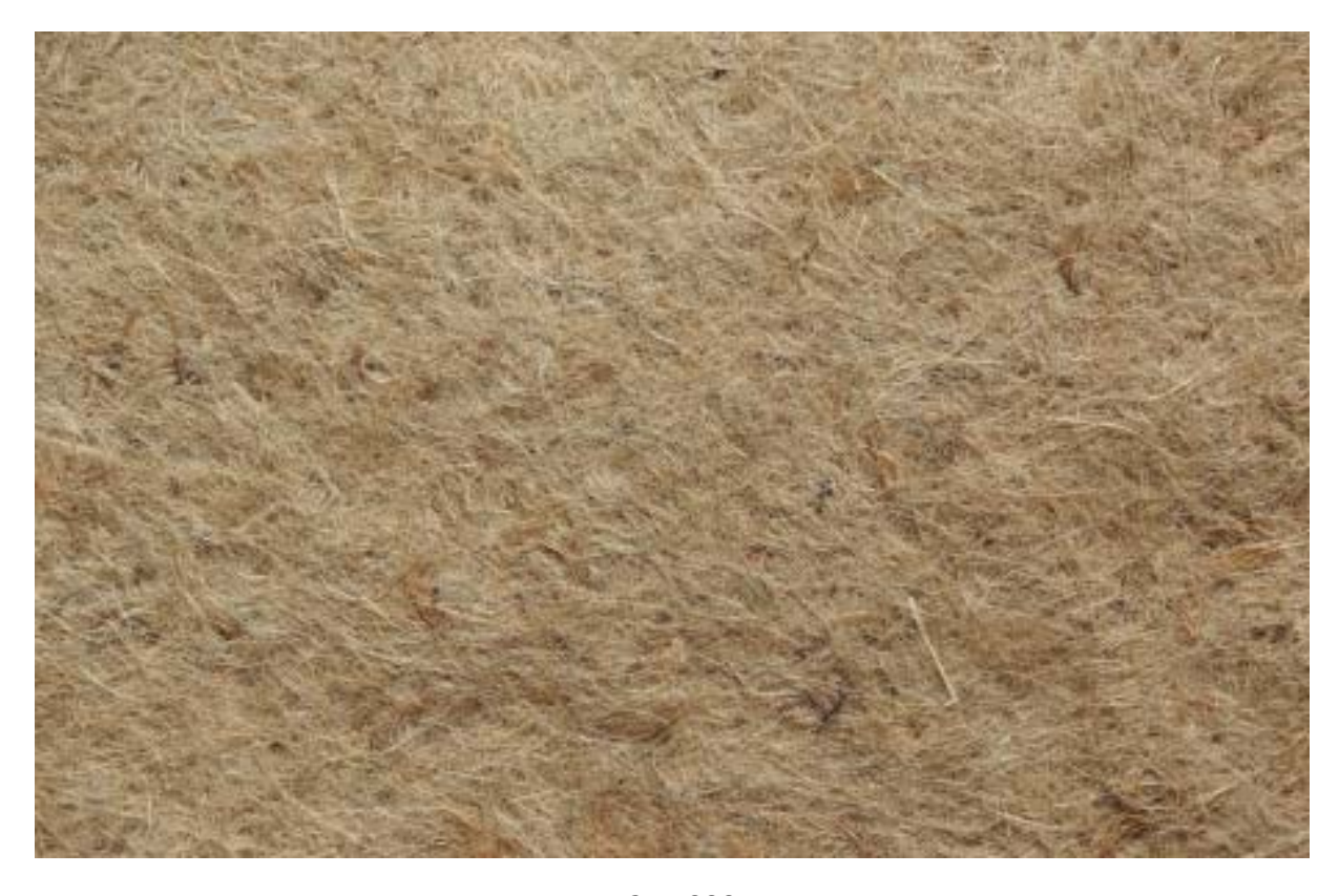
Type - 2 : 1000 gsm